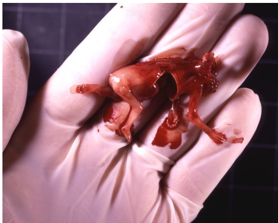
FIRST TRIMESTER ABORTED (11 WEEK)

We hold these truths to be self-evident that all men are created equal, that they are endowed by their Creator with certain unalienable Rights, that among these are Life... - Declaration of Independence