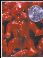
FIRST TRIMESTER (10 WEEK) ABORTED FETUS

WOULD JESUS USE BLOODY PICTURES TO MAKE HIS POINT?